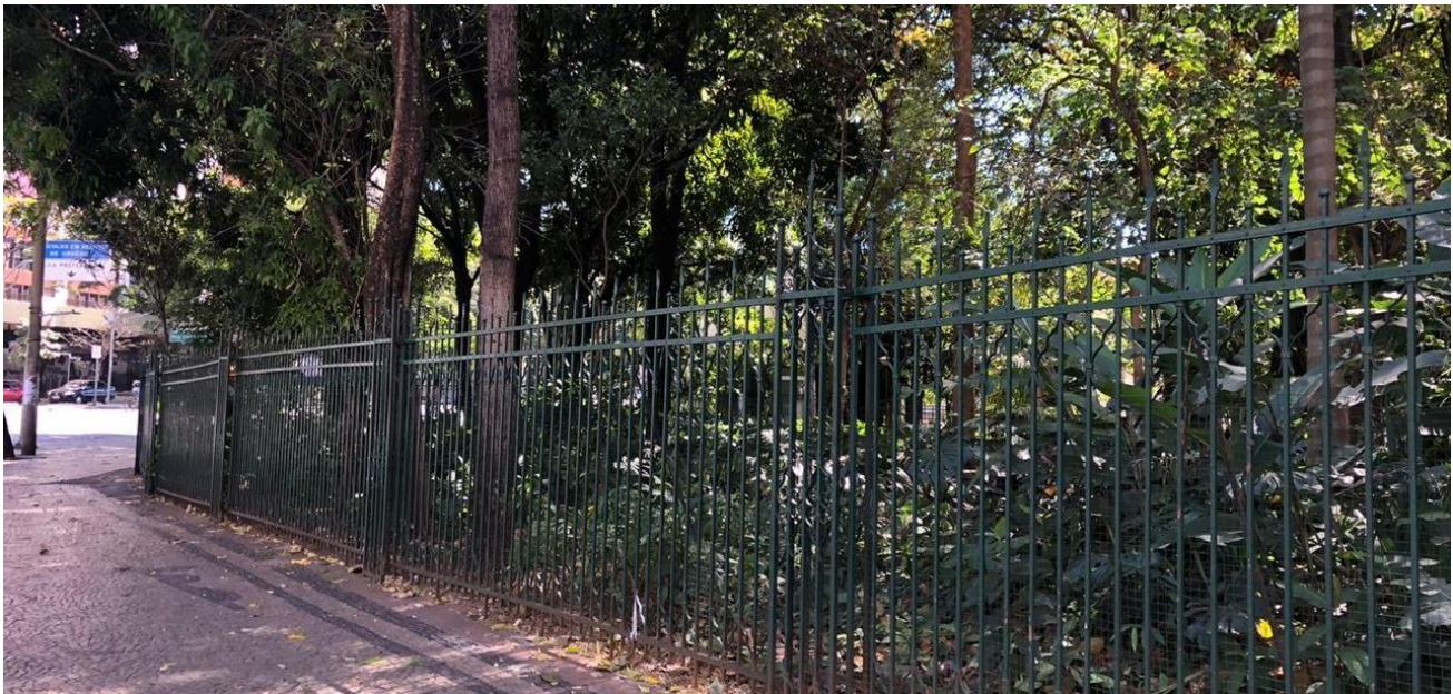
Fig. 01 Belo Horizonte's Municipal Park

The population abdicates cities' public spaces because of a series of different procedures. People who have high-income levels due to the privatization of cultural and leisure activities. People who have a low purchasing power, due to the impossibility of engaging in free social or cultural activities, either because of the fear of leaving home after dark - because there is no guarantee of security - or because of their marginalization in the cultural development process (Gonçalves, 2002). The public power aggravates this situation by isolating public spaces from collective use. It falls back on utilizing walls, or intimidating procedures, claims the lack of security generated by permanence in squares, parks, and gardens, by unemployed or "suspects", with no conditions for popular participation in cultural activities. These spaces tend to be associated with those of commerce in an attempt to transform them into a commodity to be sold.