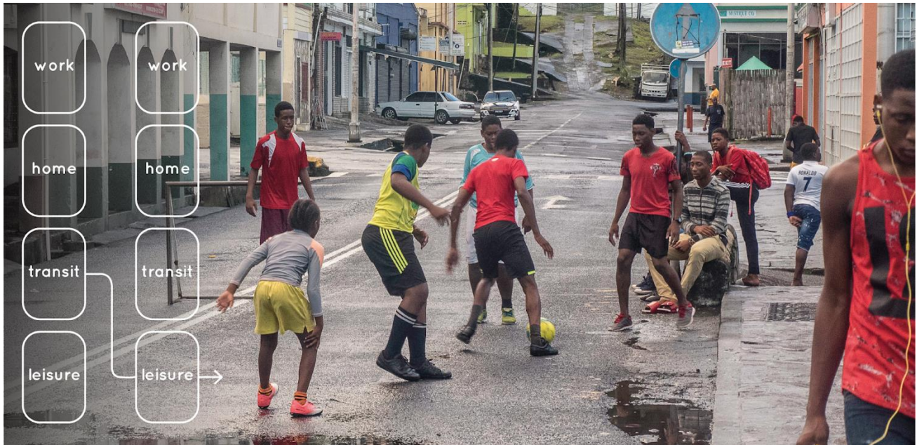
Fig. 03 Street Soccer. The result of joining the cards, for example, transit(circulation) with leisure, generates the famous street soccer, which is a common playful activity in Brazil.

The Athens Game's agency configures the emergence of a spatial imaginary that is more consistent with the reality of the community, creating connections with their empirical experiences and the fantasies of new spaces. While the dissensual nature of the game enable a more democratic environment than a participatory meeting, as it is not the game's demand that the participants have prior certainty of their wishes, but rather that the game promotes the formulation of these wishes. This game subverts the spatial rationality, which can be understood beyond a simple pastime or fictitious playful activities. It gives a base for people to think about the limitations of a functionary space, and explore new collective experiences in public space. Imagination encompasses other layers of information and communication that expand the players' experience and subjectivities.