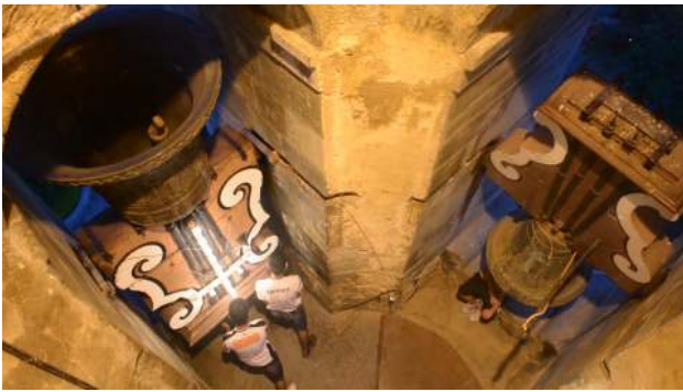
Figure 2: A Steeple with two bells.

low the rhythm defined by the visitor's particulars and can also be influenced by the movement of bodies inside the chamber. In addition to the proposed visual projections, in some moments the absence of visual stimulus inside the cabin will also be explored, with the aim of providing a sound-only experience, where the public is encouraged to concentrate only in the sound it produces and the performance interaction with the other users of the installation. This experience is based on the Accusmatic principles, where only sound is the central musical aspect and, in this case, producer of interaction.