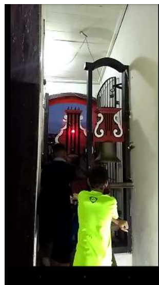
Figure 1: The vision inside the steeple.

Different periods in the catholic calendar have different rhythms and every church has a different bell set up, that comes from a single bell to up to three of them that can be combined by the composers to create all the different patterns present in the city. Based on this tradition and as a manner to emphasize this connection in a contemporary artistic way, it is proposed the installation called: PER (SINO) FICAÇÃO.