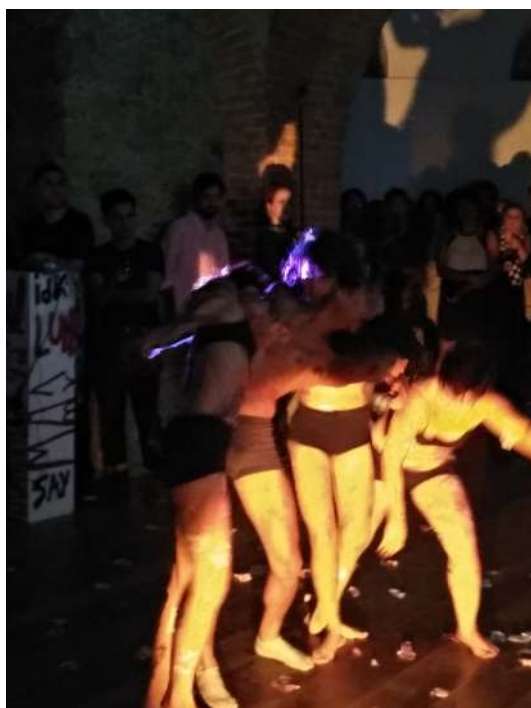
Figure 2: The performers interacting with their own projection in the final part of the performance.

The “Chaos das 5” is an audiovisual digital performance developed by the Transdisciplinary research Group (GTRANS) from the Federal University of São João del-Rei involving the ALICE (Arts Lab in Interfaces, Computers and Else) / Orchidea (Orchestra of Ideas) group from the Computer Science Department and the ECOLAB / Movère group from the Scenic Arts Department.