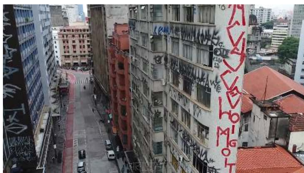
Figure 4: An urban image projected on the second part of the performance.

The free falling finishes in a second part, a disruptive experience in the real world. A territory battle in the city where people try to exist and register this existence guided this part of the performance. We projected a noisy sequence of pictures of graffiti, like in Figure 4, and other urban scenes while a city soundscape completed a saturated urban scene.