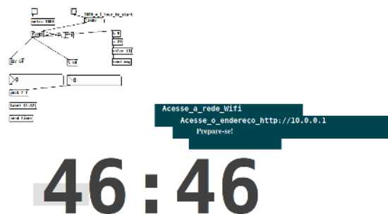
Figure 3: The countdown patch used in the beginning of the presentation.

We started the performance with the projection of a countdown clock and an invitation to take part of the performance accessing a website (Figure 3). In the website, the audience members could find some instructions and instruments that could be used during the show. These information was hidden and in the beginning of the performance we have a game like a treasure hunting to find some clues to access a key and take part of our experiment. Audience members could also inform their names and upload a picture to register their participation in the performance.