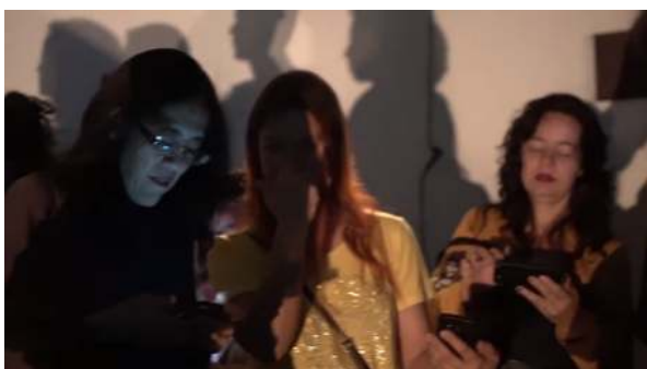
Figure 1: The audience participation during the performance O Chaos das 5

Another performance used mobile phones not only to the audience. Aiming for high-scale musical performances and using mobiles as DMIs, a musical performance called Echobo [5] was developed, which was based on the use of two types of instruments implemented in a smartphone application: one for the maestro and one for the public. The conductor was responsible for defining the progression of chords, which although it does not emit any sound, it is responsible for controlling the harmony of the sounds produced by the public. The public, from the harmonic constraint set by the conductor, can play note by note within the defined harmonic field. The audience studied was between 20 and 120 participants and the feedback received was that when using the Echobo they felt more connected to music and other musicians. That is, the creation of instruments with user-friendly interfaces seems to be a very promising idea regarding public satisfaction.