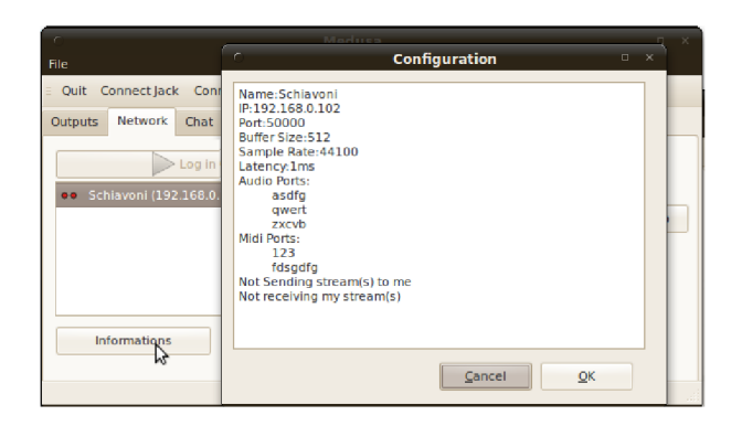
Figure 3: Setup tab - local node information

Figure 2: Network tab - connecting to/disconnecting from others nodes